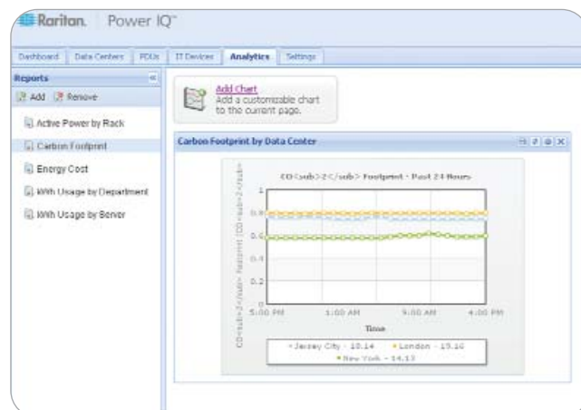
Power IQ Carbon Emissions Report

PDU has an LED power meter and serial and Ethernet ports. With a click or two on a web dashboard, AOL’s IT staff is able to obtain power information for each piece of equipment, as well as information from temperature and humidity sensors from anywhere in the world. Power information gathered includes data on voltage, current (amps), power factor, apparent power (kVA), active power (kW) and energy consumption in kilowatt hours (kWh).