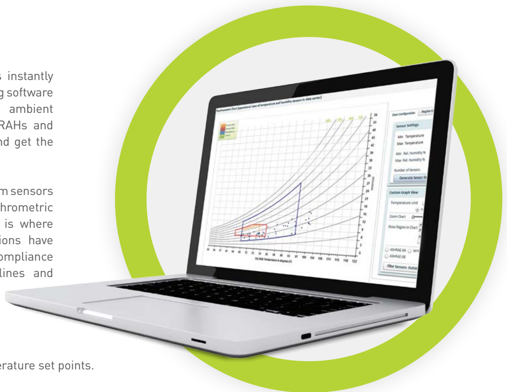
Patented Real-Time Psychrometric Charts